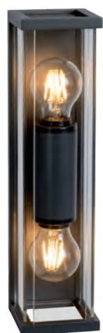
3501783006493 Grafito-Graphite 2L×E27