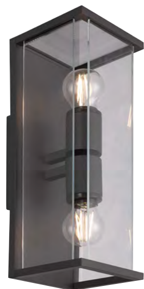
3501783006492 Grafito-Graphite 2L×E27